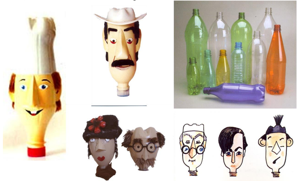
Figure 4 : Project developed for Continuing Education Schools teachers in Rio de Janeiro focused on ecological awareness. Source: (Oliveira, Eduardo Andrade, Magazine Forever 2011, 150-151)