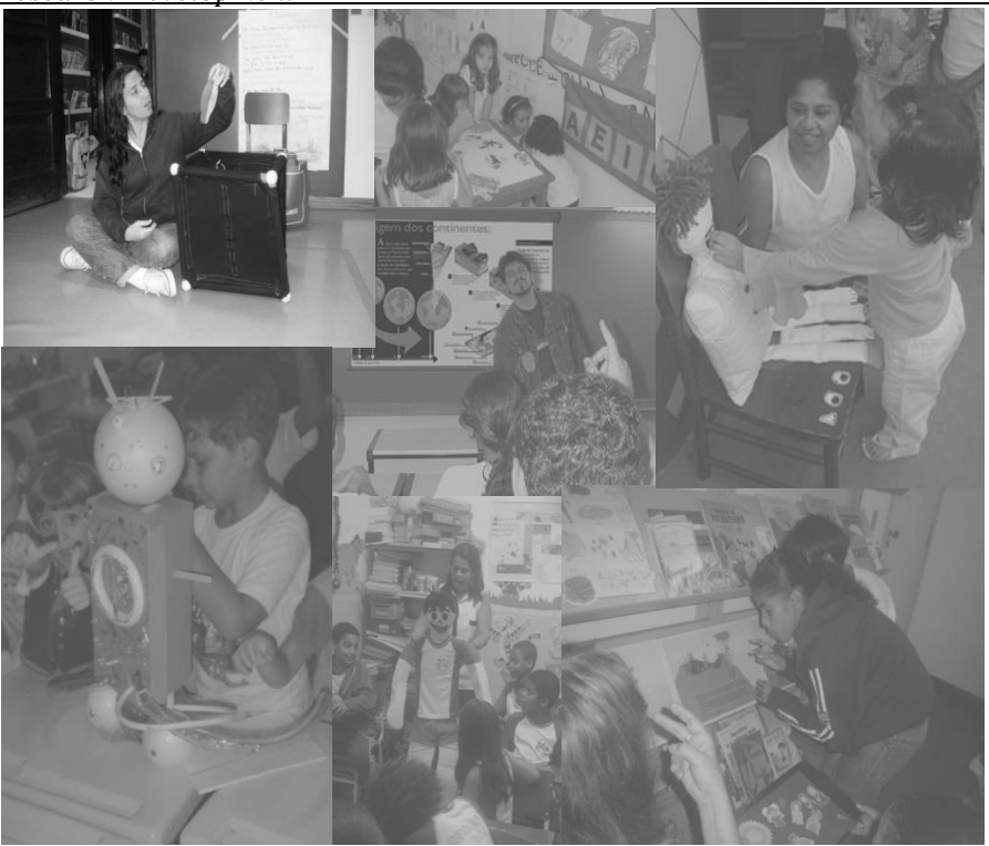
Figure 1 : Projects developed in Rio de Janeiro Schools in the discipline Basic Design Concept and Context where graduate students use the methodology Design in partnership with teachers and students to develop teaching resources for different subjects / teaching practices. (Baptista, Fernanda Nazareth)