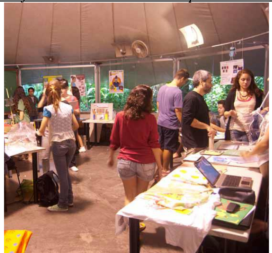
Figure 5 : Project Exhibition developed for the Department of Education of Sao Tome and Principe Source: (Portas, Roberta 2012).