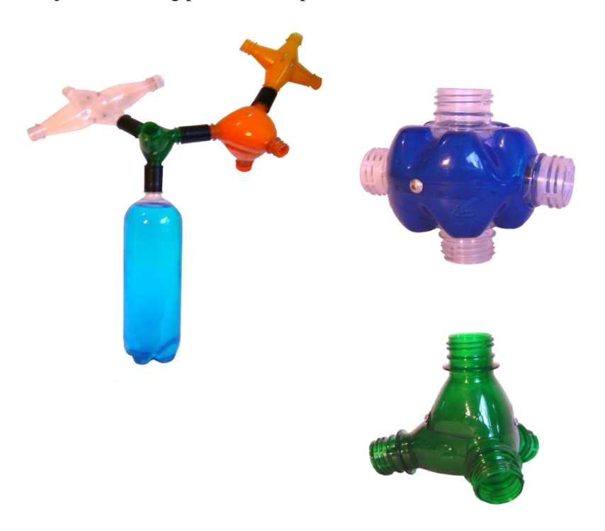
Figure 2 : Project developed at Symposium for Schools Continuing Education teachers in Rio de Janeiro focused on Portuguese discipline. (Oliveira, Eduardo Andrade)