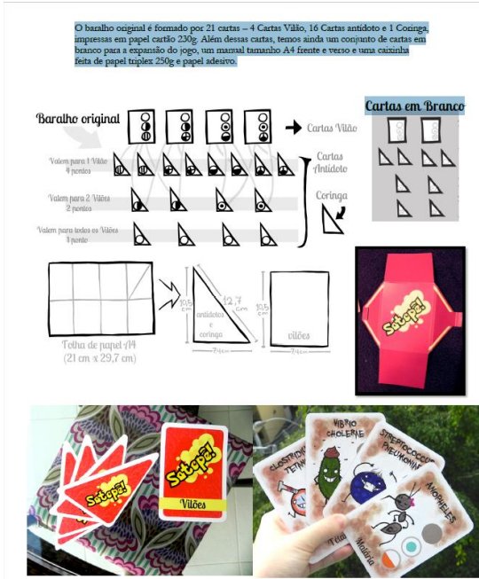
Figure 6 : Project developed for use by teachers and students from kindergarten to Sao Tome and Principe with a focus on awareness of the health problems.